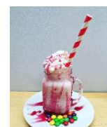
Unicorn Vanilla, Raspberry & 'Skittles'