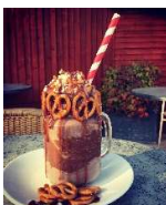
New Yorker Chocolate, Nutella & Pretzel