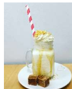
Sweet Seaside Vanilla, Toffee & Salted Caramel Fudge